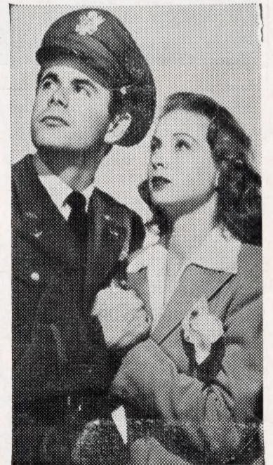
Flight Lieutenant Mat 1-A; Prod. Still No. 148

His parachute leap, in a scene with O'Brien, was made from a 50-foot platform with an extra large chute.